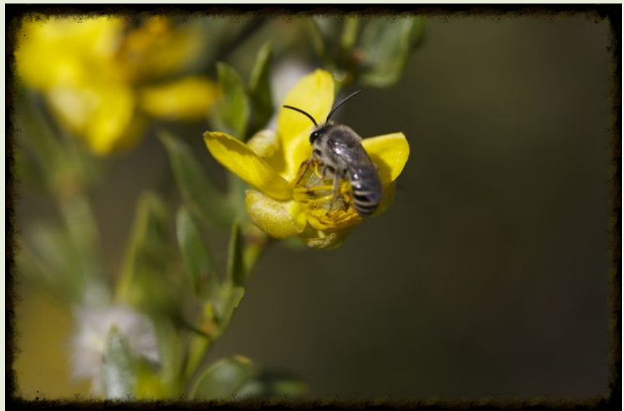
Flowers of Larrea tridentata (Creosote Bush)

Having lived in temperate climates most of my life, I am used to spending the winters planning for spring. In Tucson, we not only enjoy mild winters, but also get to the fun part of planting much sooner—just a few