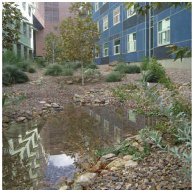
Water harvested from surface runoff pours into basins to support establishment of deep rooted, native trees.