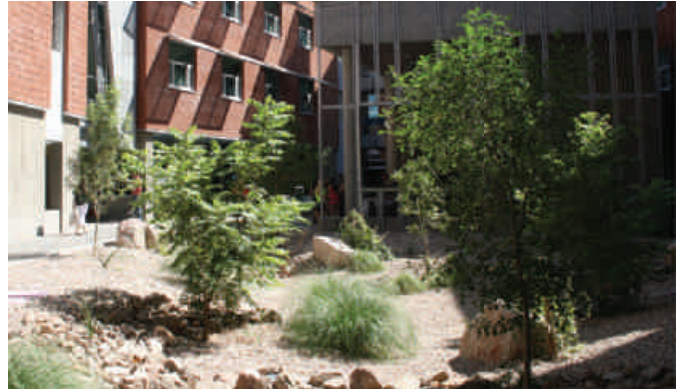
Native trees find a suitable home in the residence halls.

The planting soils were analyzed and amended according to recommendations provided specifically for the mesoriparian trees. In areas where the trees were surrounded by pavement, Structural Soil™ (with amendments) was incorporated around the perimeter of the planter opening, varying in width and 5 feet deep. In order to improve water delivery and reduce water consumption, Irrigation Consultant Carl Kominsky specified separate valves for the mesoriparian trees and Deep Drip stakes to be used in combination with drip emitters. Soil moisture sensors were located throughout the planting areas at depths of 8" and 24" providing soil moisture information to the irrigation controller to prevent both under and over-watering. In support of sustainable practices, numerous passive water harvesting techniques—for both on and off site stormwater and A/C condensate sources were implemented. Traditional water harvesting practices such as micro-basins, swales, check-dams, and recessed grading were employed. A final innovation required, given the deep rooting characteristic of mesoriparian species, was to distribute harvested stormwater to sub-surface soil depths. The perforated pipe system collects stormwater and distributes water throughout the site to a soil depth of 3+ feet by way of a Deep Water Distribution System devised by Stantec Civil Engineers.